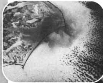
Electronic enhancement of Pamlico Sound, North Carolina, from a satellite photograph.